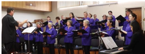
In fine Rhythm

What a buzz to sing in 3 concerts last year after being constrained by COVID guidelines for most of the year. Our concern for social distancing was annulled as soon as we sang Rhythm of Life and Our Christmas in Alma Activities Centre. We were thrilled with the warm, spirited audience and good acoustics. Tremendous fun was had at our second Rhythm of Life concert at the Palais Theatre in Franklin. It's such a majestic theatre and a source of pride for the locals. Frank's Cider House and Café dished up lovely food to the hungry choristers as well!