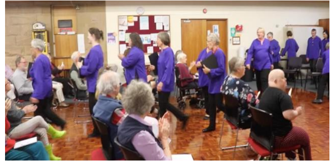
Strutting off the stage